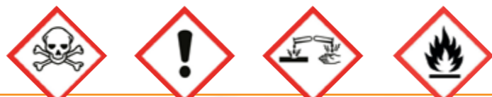
Acute toxicity Health hazard/Hazardous to the ozone layer Corrosive Flammable

Many cleaning products and chemicals on sale in store feature warning symbols. It is important to be aware of what these warning symbols mean if a customer is concerned about the product. Examples of some of the warning symbols are included in this box. Keep out of children's reach. For a full list of warning symbols and their meanings, please contact your local trading standards office or visit: http://www.hse.gov.uk/chemical-classification/